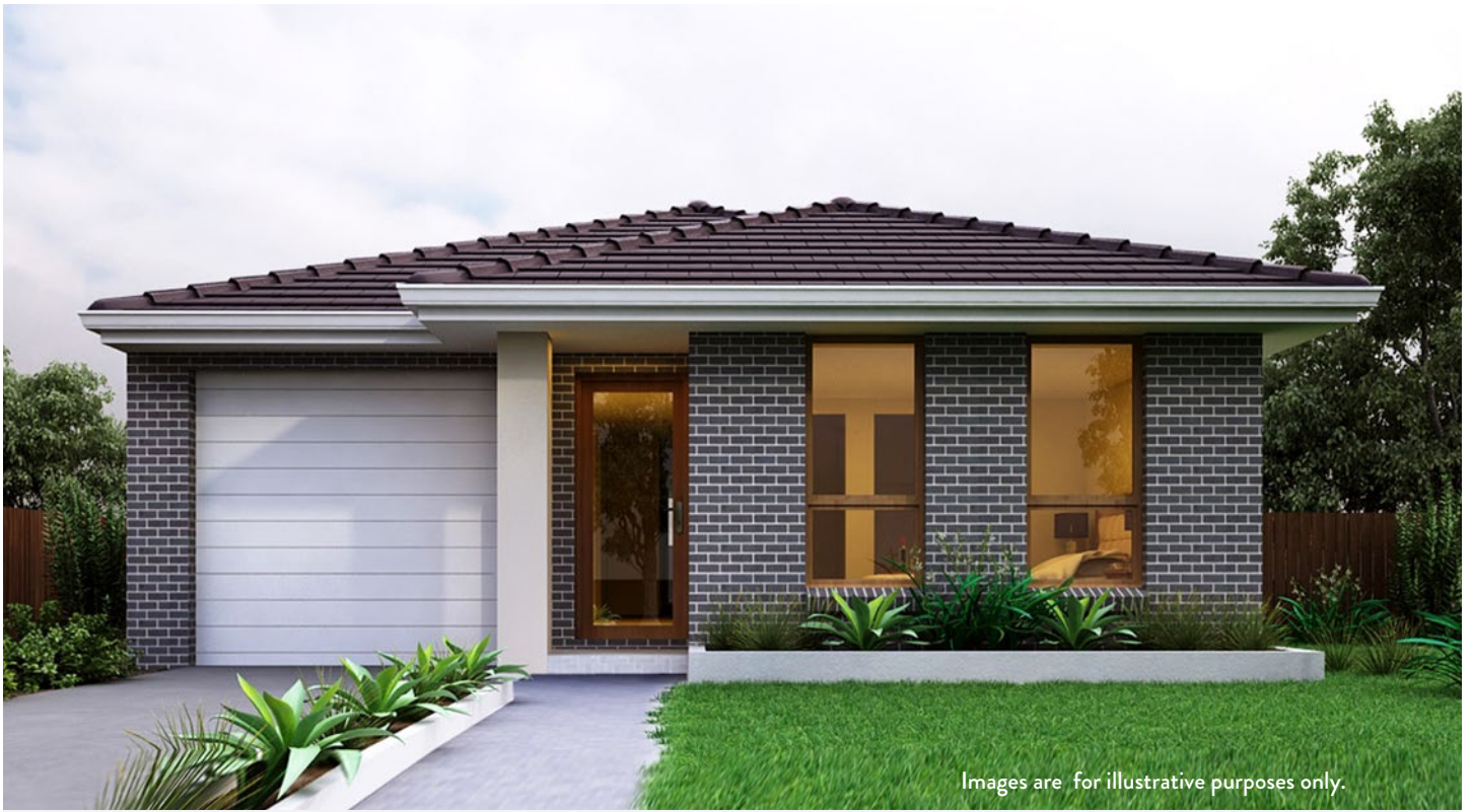
Images are for illustrative purposes only.